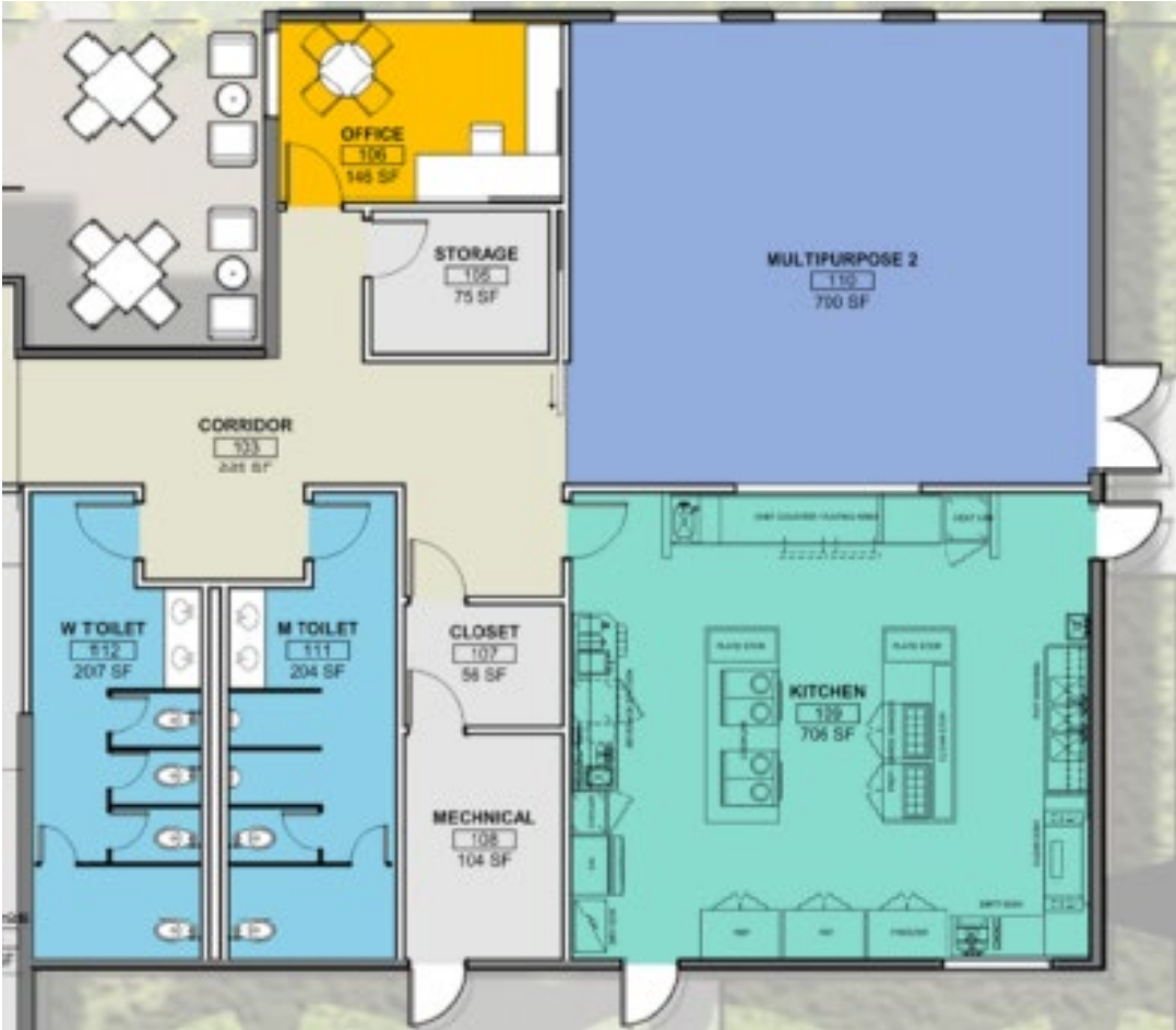
Conceptual design of renovated Multipurpose Room 2