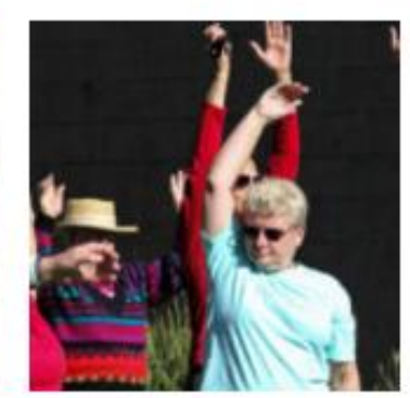
Wellness Walk participants stretch and warm up at the Fallbrook Community Center before embarking on a walk in celebration of the healthcare district's new name, Fallbrook Regional Health District.