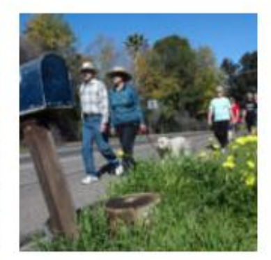
Fallbrook Wellness Walk participants enjoy the FRHD's first Wellness Walk, Feb. 1.