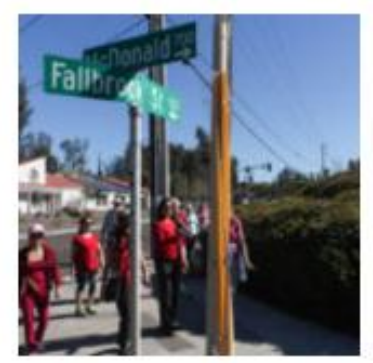
Wellness Walk participants walk through Fallbrook to promote good health, Feb. 1.