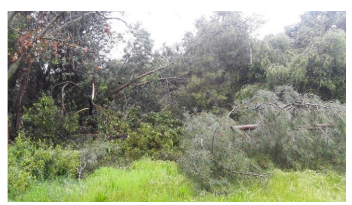
Next to House - View 2