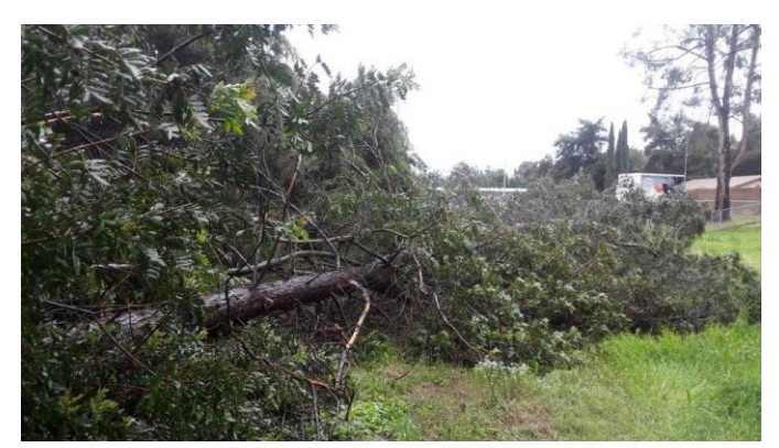
Next to House - View 1