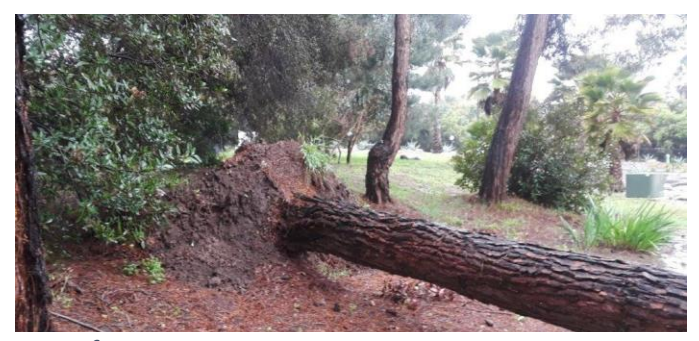
East of Community Room - View 4