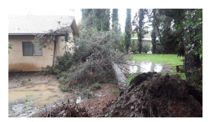
East of Community Room - View 1