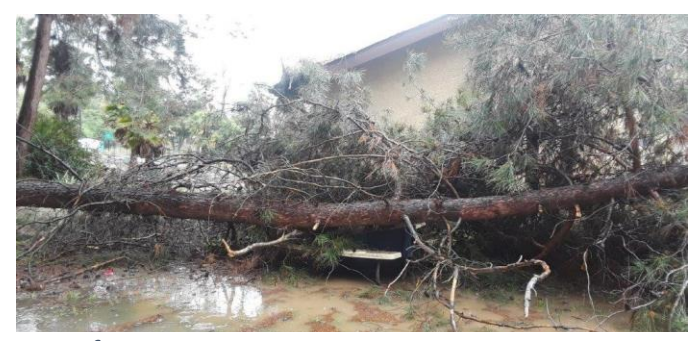
East of Community Room - View 3